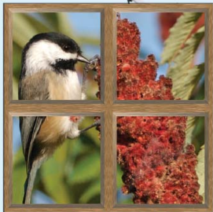
BLACK-CAPPED CHICKADEE FEEDING ON NATIVE SUMAC